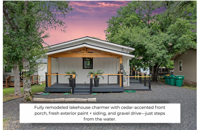
Fully remodeled lakehouse charmer with cedar-accented front porch, fresh exterior paint + siding, and gravel drive—just steps from the water.

Rare Find: Positioned on a deep, open-water cove—not a narrow canal—this is true lakefront living. Perfect for swimming off the dock, lounging on lily pads, and hosting unforgettable gatherings. Welcome to your reimagined lakeside escape in Granite Shoals—one of Lake LBJ’s most sought-after and laid-back waterfront communities. This turnkey retreat blends modern Hill Country style with relaxed lake living, offering direct lake access, a fully renovated private boathouse with guest suite and jet ski slip, and over $300K in upgrades. Ideal for full-time living, weekend getaways, or a high-performing STR. With a second bathroom, the boathouse could become a future B&B suite or true in-law unit. Inside, enjoy an open-concept layout anchored by a dramatic floor-to-ceiling window wall with panoramic lake views. The kitchen features an Emerald Green Quartzite waterfall island, and the spa-like bathroom boasts premium finishes you won’t find in a typical flip. The boathouse is a wellness sanctuary with a built-in sauna for hot/cold therapy, plus new siding, windows, and floors. Highlights: • Brand-new septic (pool-ready) • New roofs on house + boathouse • Whole-home water filtration • ~$40K bathroom remodel • ~$40K kitchen remodel • ~$20K window wall • Trex upper + lower decks Granite Shoals offers 19 city parks, boat ramps, courts, and trails—just 10 mins to Marble Falls and under an hour to Austin.