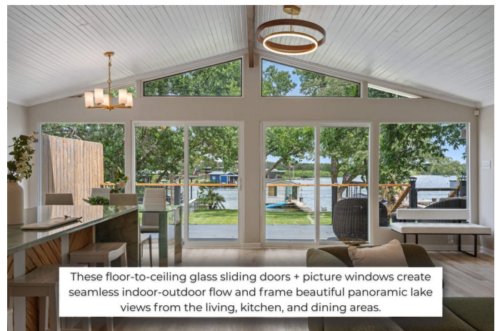
These floor-to-ceiling glass sliding doors + picture windows create seamless indoor-outdoor flow and frame beautiful panoramic lake views from the living, kitchen, and dining areas.